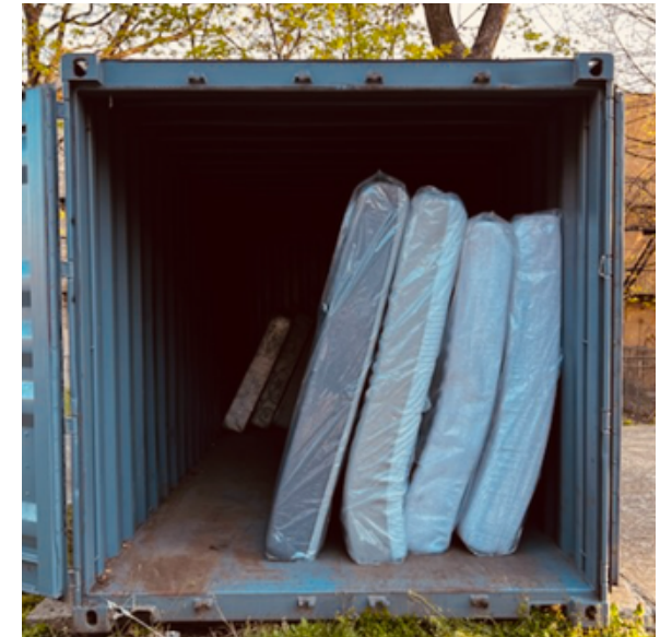
Illustration A-1: Demonstrates proper storage and wrapping of mattresses:

Fill container with mattresses loaded from back to front VERTICALLY to maximize space and reduce cross contamination.