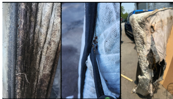
Illustration A-2: Demonstrates examples of contaminated units

ALL MATTRESSES should be wrapped in appropriate size mattress bags. Mattresses should be stacked VERTICALLY inside of the container. This will also help to reduce cross-contamination from moisture, rust, and bed bugs. For example, please see illustration A-1. Please be sure to load ALL mattresses and box springs into containers. Please ensure there is no garbage or equipment blocking access to the container. Contaminated units (bed bug, swelled with water, or mangled/damaged) may be left outside of the container by RRI for staff to dispose of. See illustration A-2 for examples of contaminated units. Close and lock the container after each loading. For all pick-ups, Renewable Recycling, Inc. will open the container.